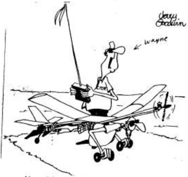
We all recall the Wayne Air to Grecia (The great flight to remote places)