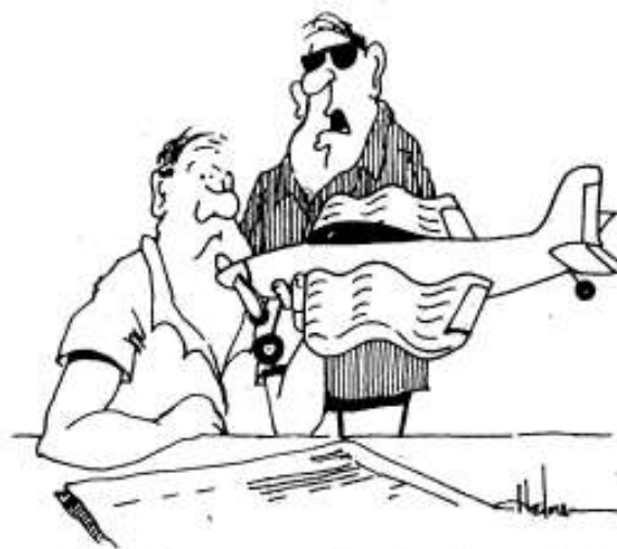
Remember your first attempt at negotiating a deal?