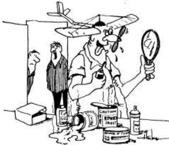
Remember the old days, so proud, too much time polishing the paint?