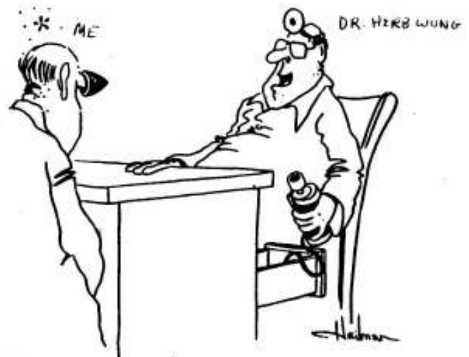
"NOW YOU JUST RELAX! THIS ISN'T THE FIRST TIME I'VE SEEN THIS SORT OF THING HAPPEN." This is how they are taking this one! The doc was well prepared!