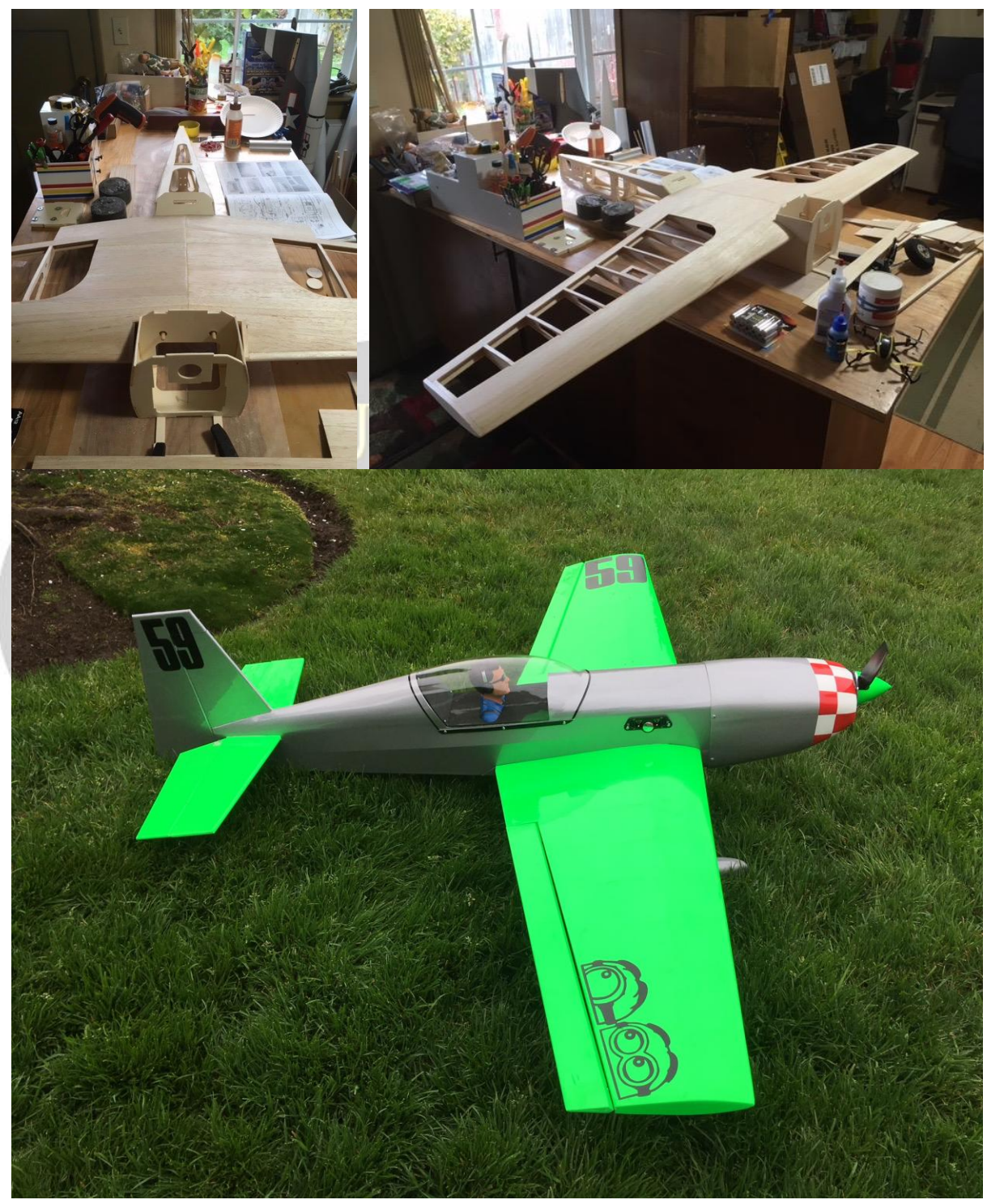
Jeff Lutz's Extra 300