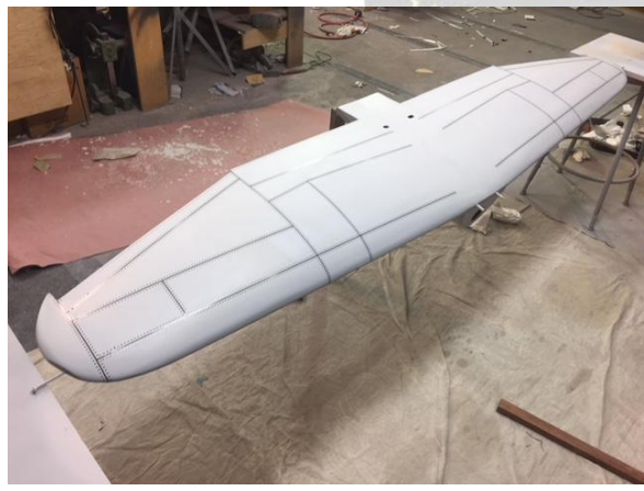
Franks P-47 Wing, Rivets and Panel Lines Ready to Prime