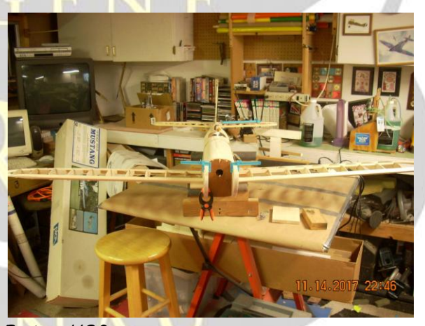
Chick Fosters HOG