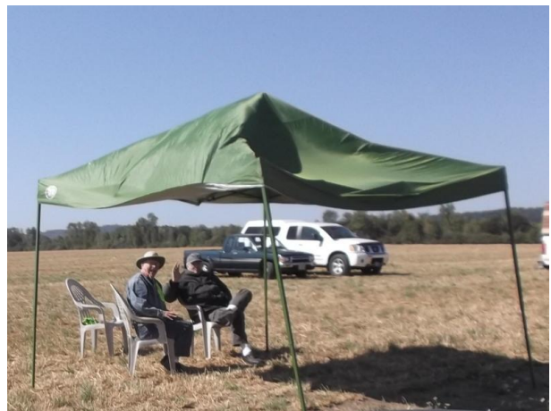
Saturday parking crew