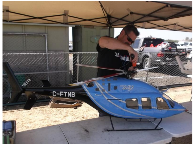
Preping to fly