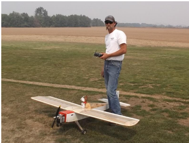
Snoopy the CANDY DROP plane and pilot