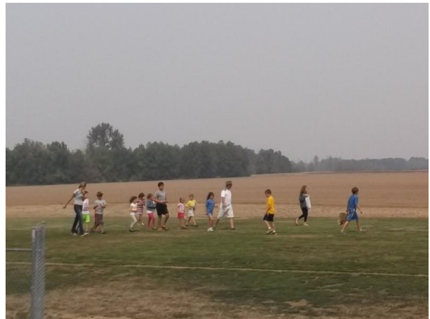
Gathering the candy