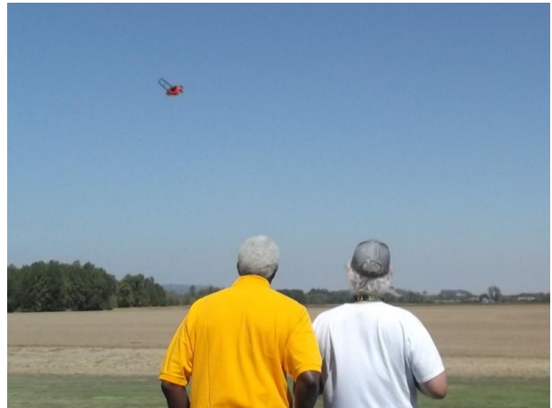
Flying lawn mower