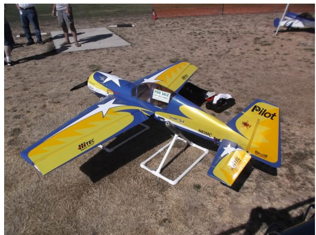
May be for sale