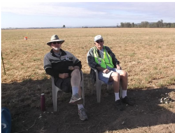
Friday parking crew