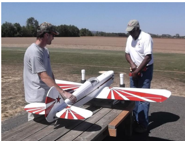
Ready to start