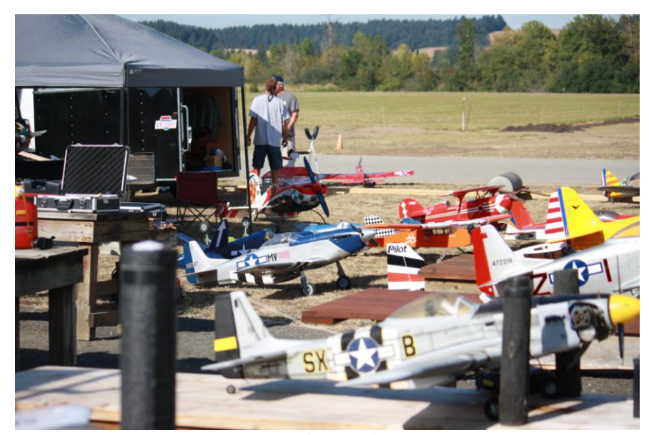
Lots of Aero-Planes