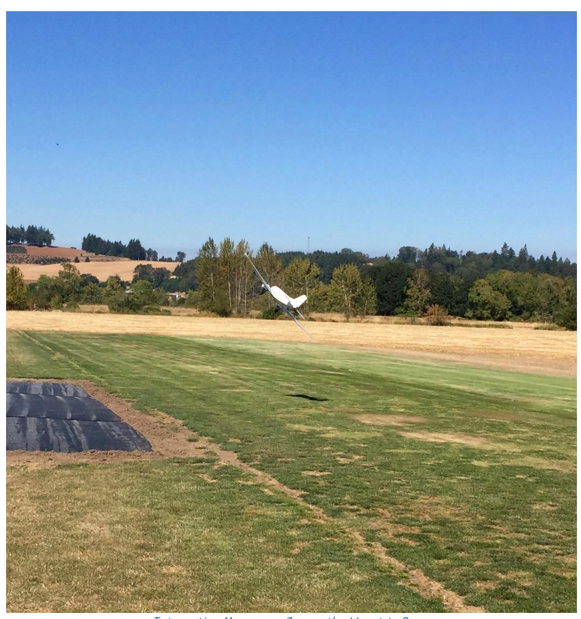
Interesting Maneuver, Causes the Heart to Pause