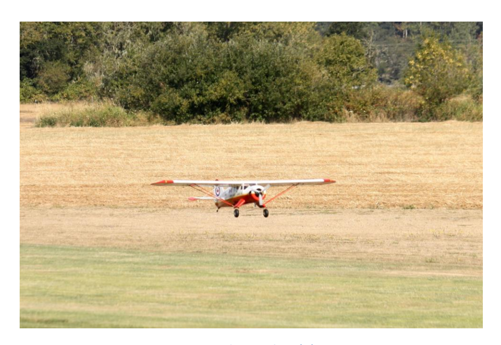
Warren About to Touchdown