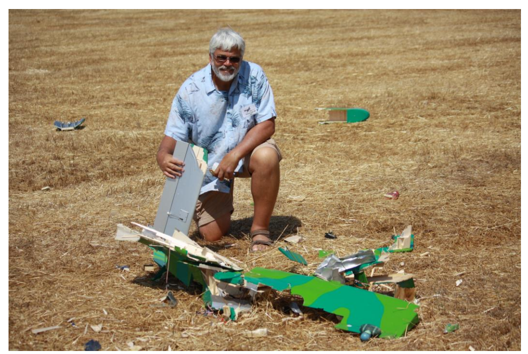
Roger's Bronco OV-10 After Elevator Loss