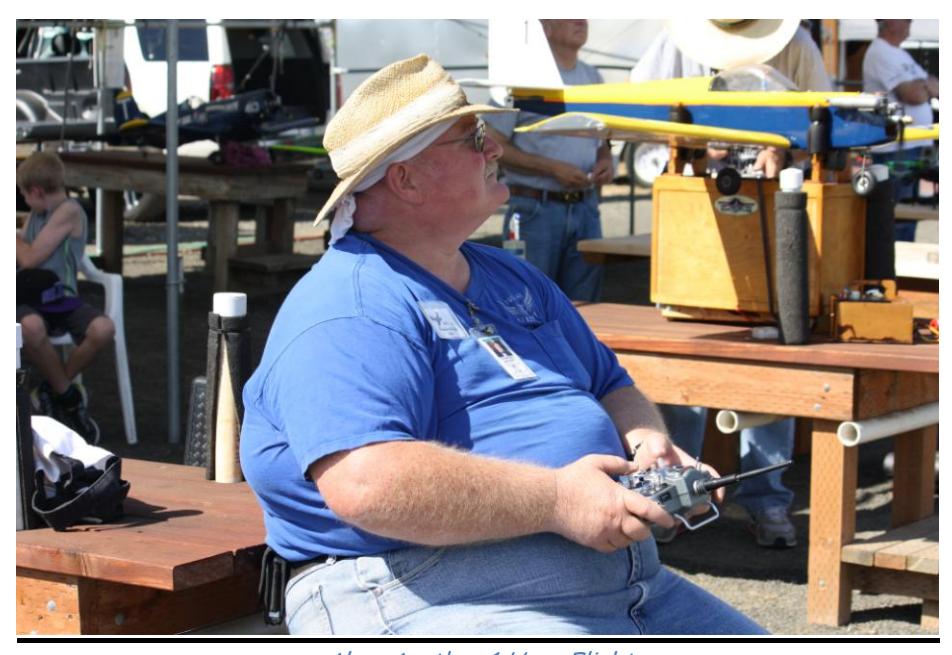
Al on Another 1 Hour Flight