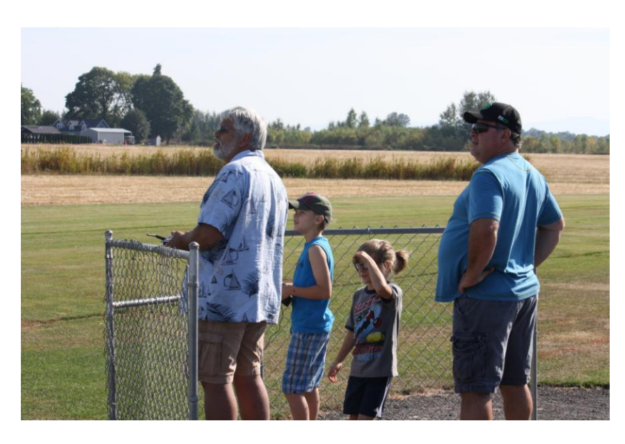
Roger Doing Some Training and Recruiting