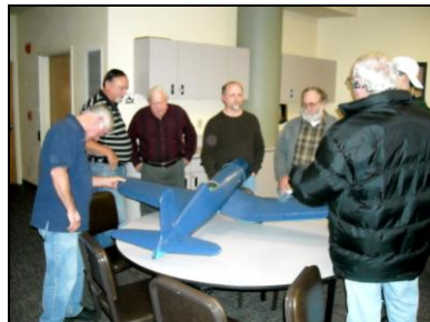
Corsair show and tell