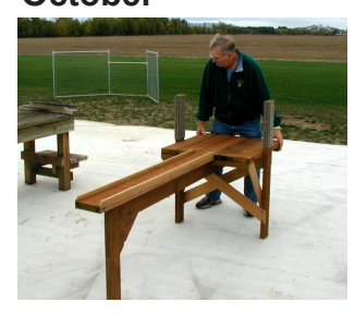
Cool - New pit tables