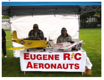
Scouts get RC flight offer