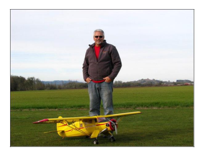
February 8 - COLD 38 degrees - wind 5 mph from the North February 15 - Not a good day, overcast, cold, and windy