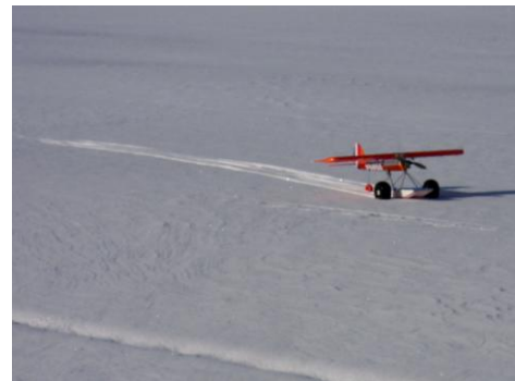
Jim Corbett's Crazy Max

January gave us some good flying days, you just needed to be ready to take advantage of them when they arrived.