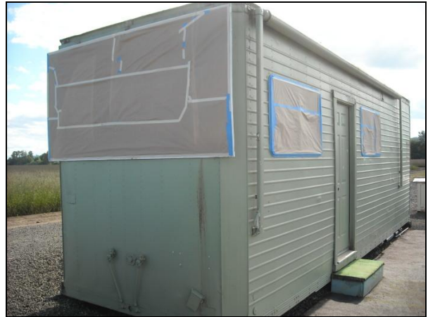
Club house masked