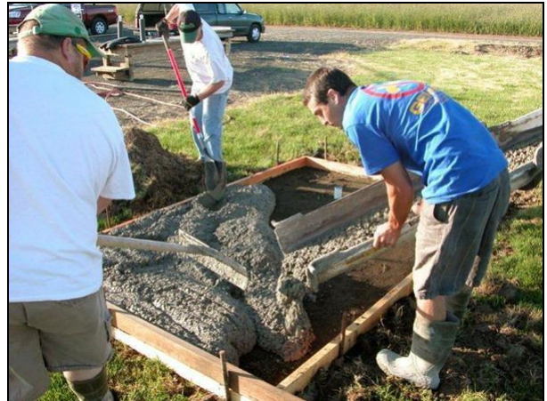
Push it around