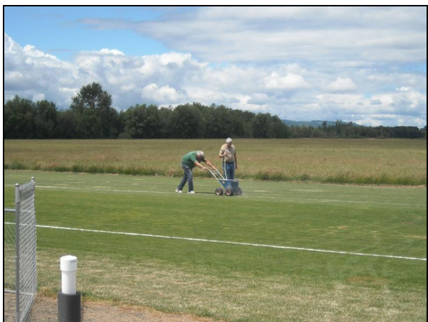
South and center lines in lime