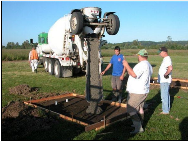
Pour it in