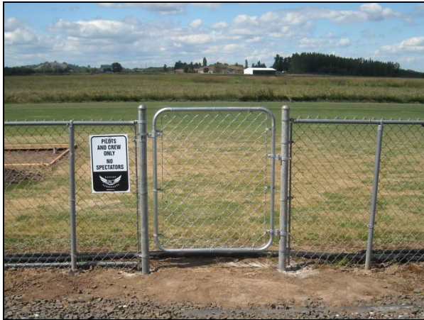
Gate installation finished