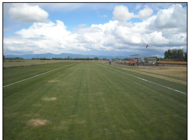
Approach from the west view