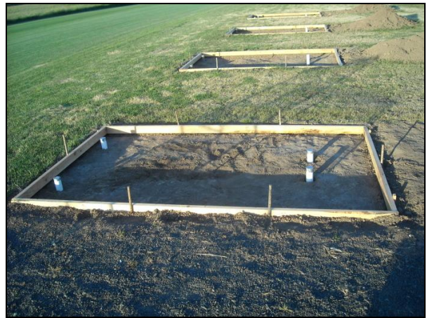
Forms and inserts ready