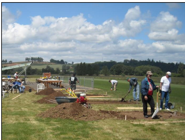
Digging out for Big Bird pads