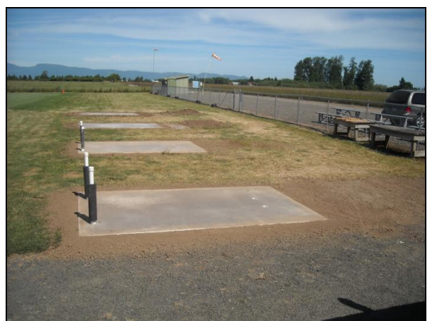
Ready to use