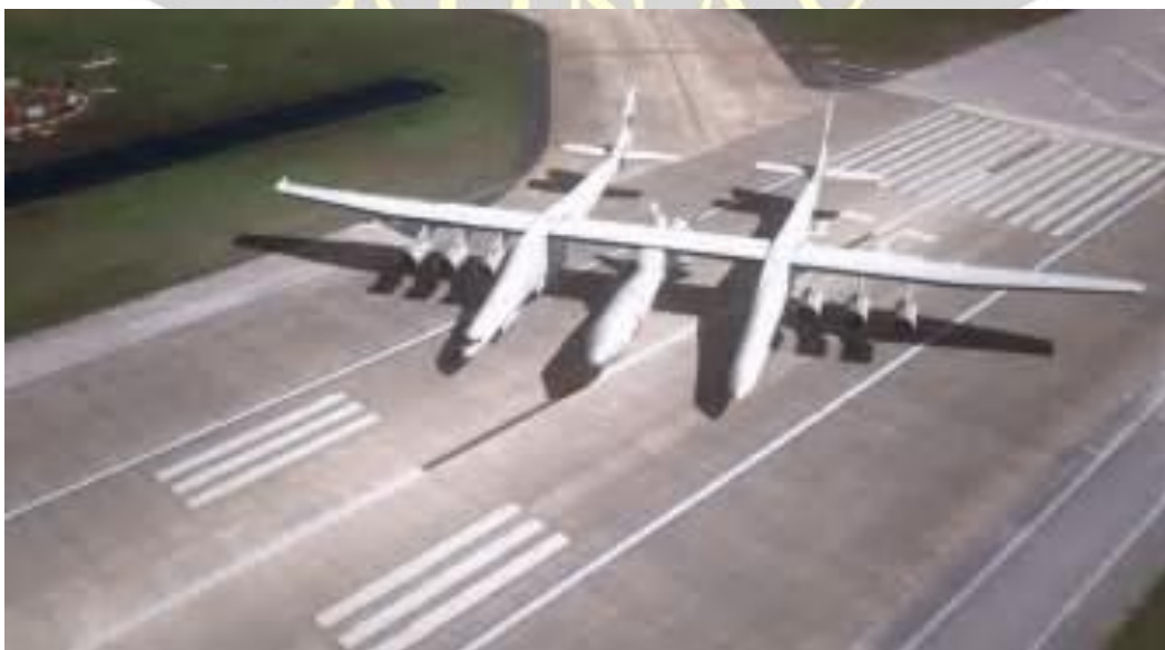
Wingspan 365 Feet