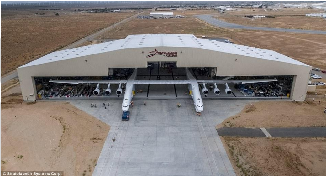
Paul Allens Rocket Launching Airplane

And as you might expect Paul Allen is partnered with Engineering Genius and AMA member Burt Rutan (Scaled Composites).