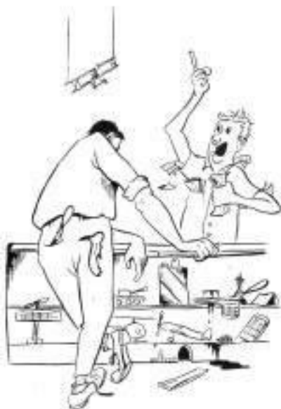
THE HOBBY SHOP OWNER