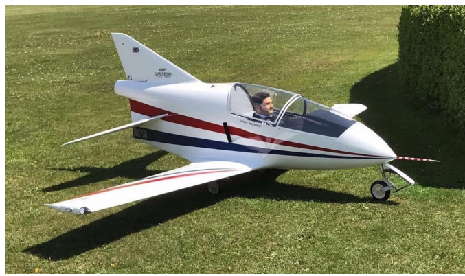
60% BD-5 JET

If you have a build project that's new or have updates to a project we showed in a previous newsletter please send some pictures along with information about the project so that we can share it in the newsletter. New additions to your hangar are also a great item to share. Send some pictures of your shop.