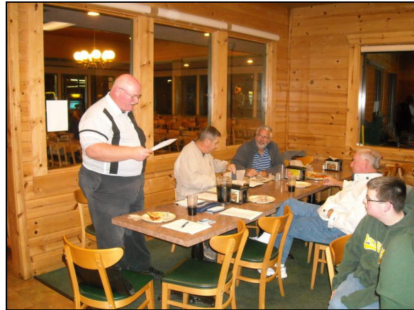
And the meeting began

January 23 — Wed — EWEB February 26 — Tue — Roaring Rapids Pizza March 21 — Thurs — EWEB April 22 — Mon — EWEB May 29 — Wed — EWEB June 25 — Tue — Field