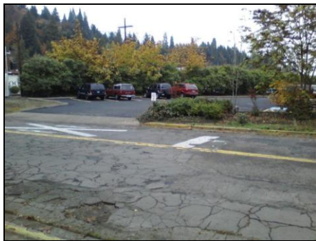
Parking across the street.

At the October Pizza meeting - 18 members and guests attended.