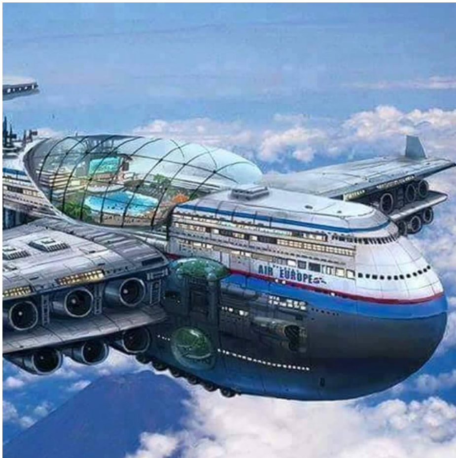
A new Hangar 9 ARF

There was a discussion about making the flying field location easier to identify on the ERCA website by adding addresses and making the location directions more prominent on the website. The meeting was adjourned at 7:36 p.m.