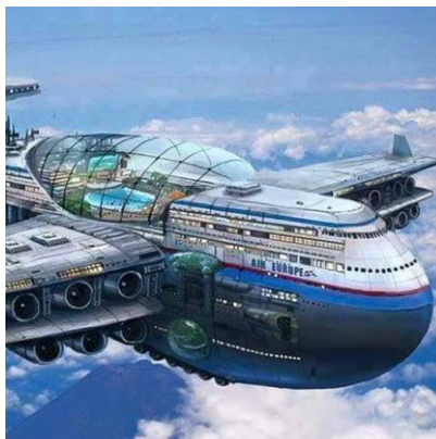
A new Hangar 9 ARF