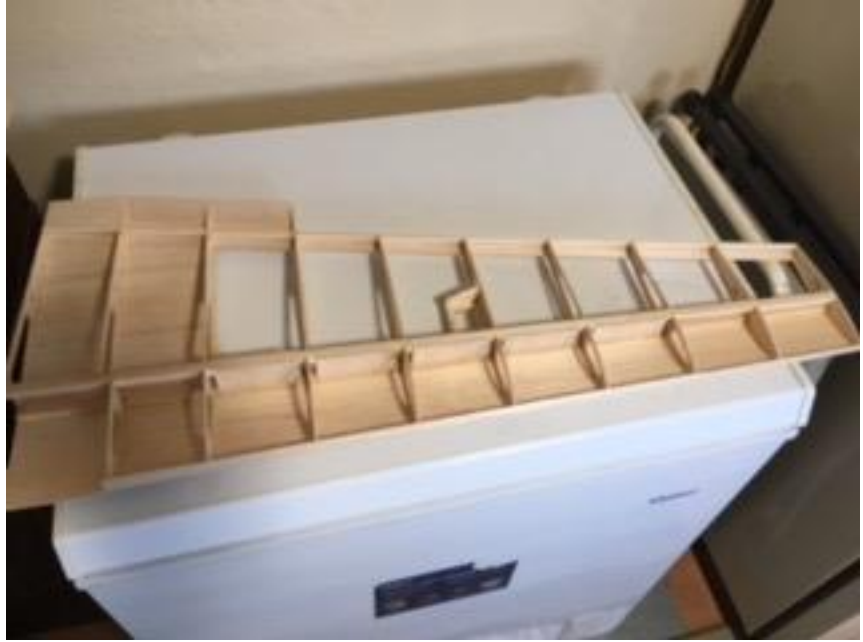
Jeff Lutz's Extra 300