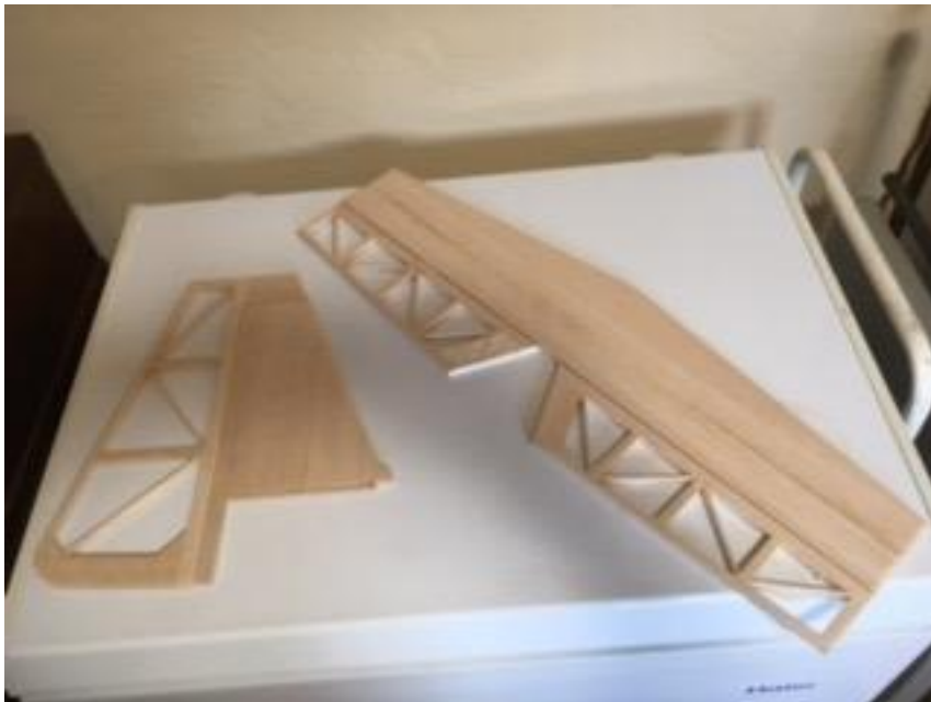
Jeff Lutz's Extra 300