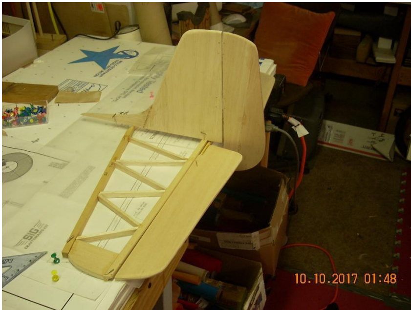
Chick Fosters Hog