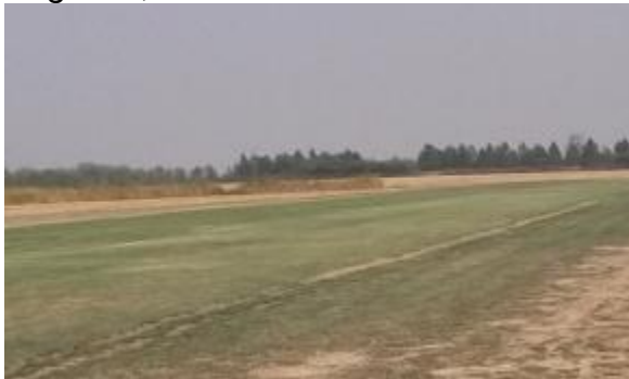
Before Monster Fest