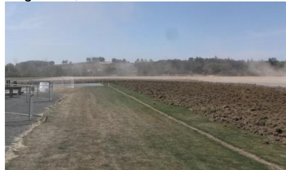
Plowed and disked