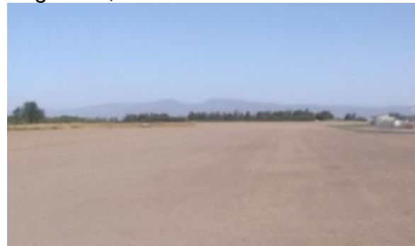
Leveled and rolled

September 16 th Runway seeded and rolled.