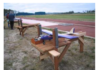
Benches in use