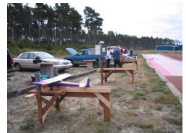
Benches in use