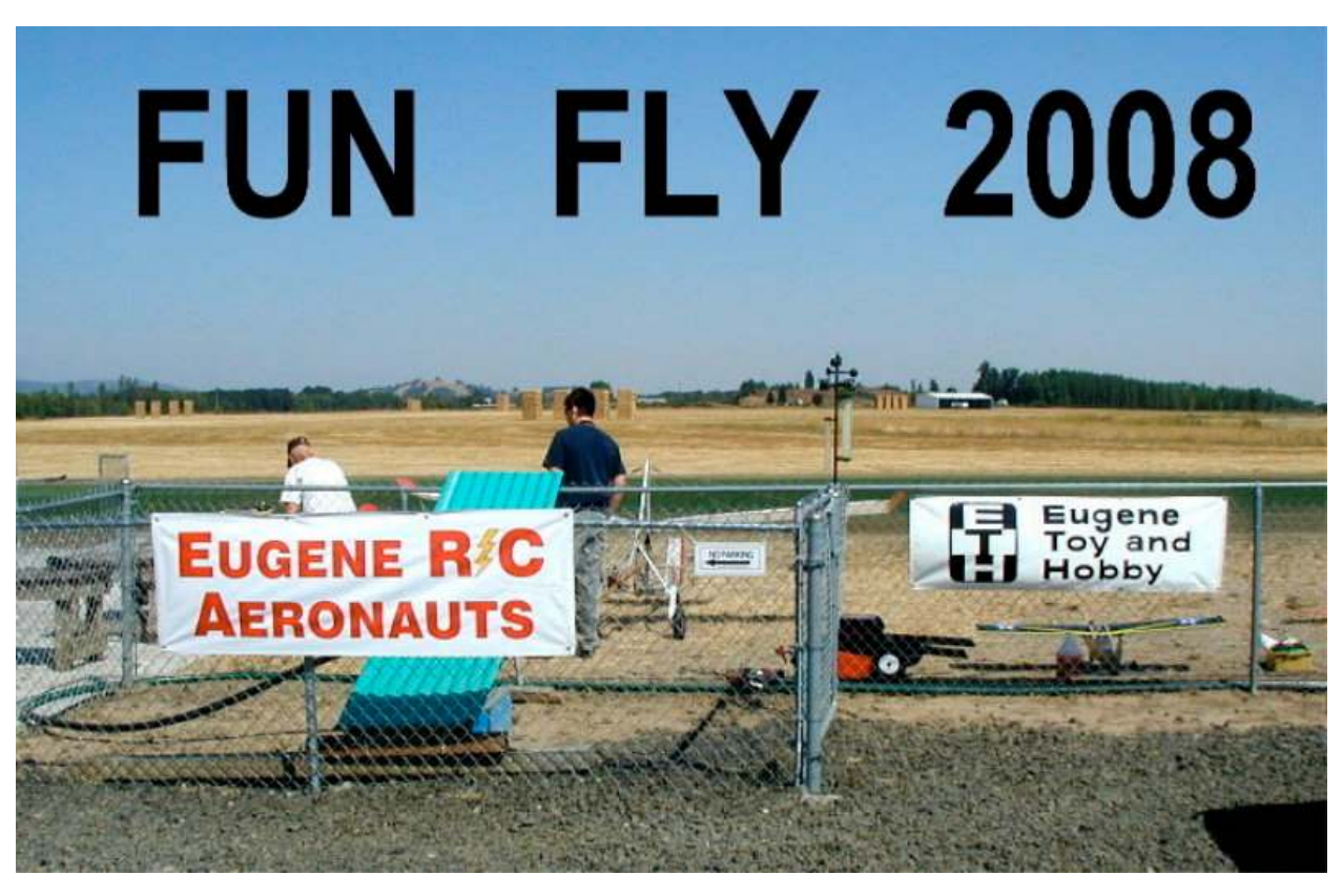
36 flyers and 11 visitors attended Saturday August 16<sup>th</sup>.