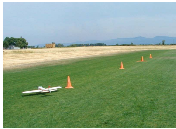
Jim Corbett photos