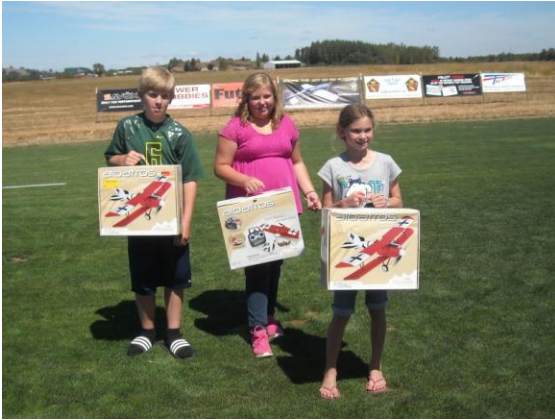
Saturday Candy Drop airplane winners