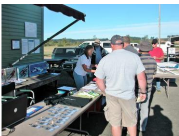
Here they come