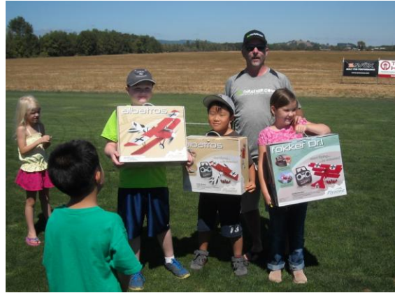
Sunday Candy Drop airplane winners