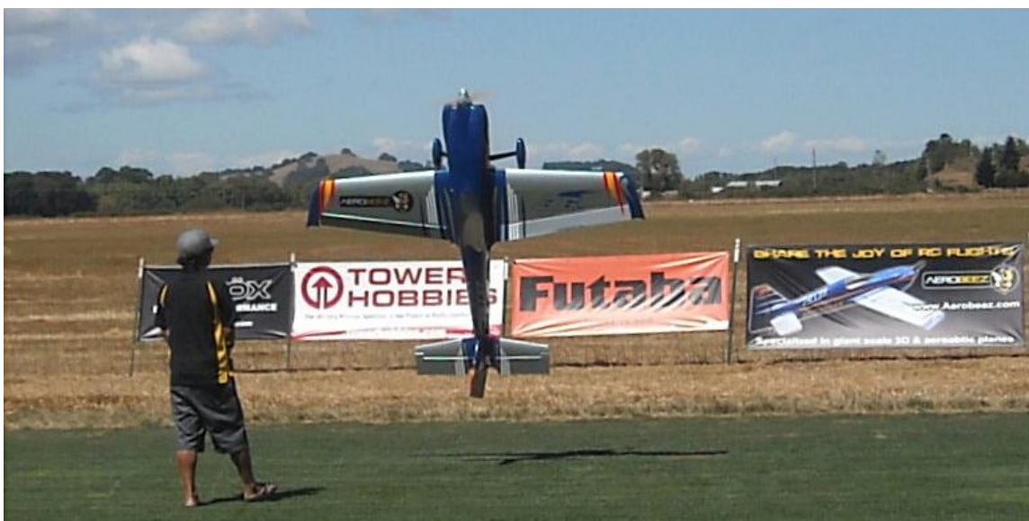
3D Demo by Aerobeez pilot Pete Young

40+ pilots and approximately 500 spectators in attendance. It was hot with light winds.