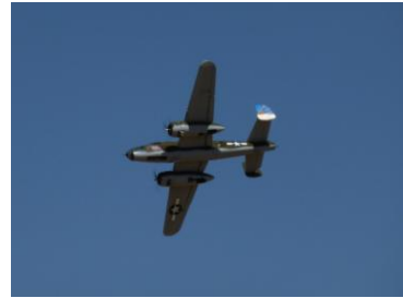
B-25 in the air