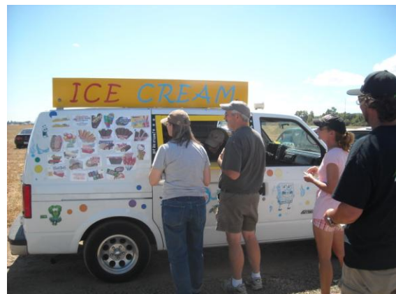
Cindy's Ice Cream