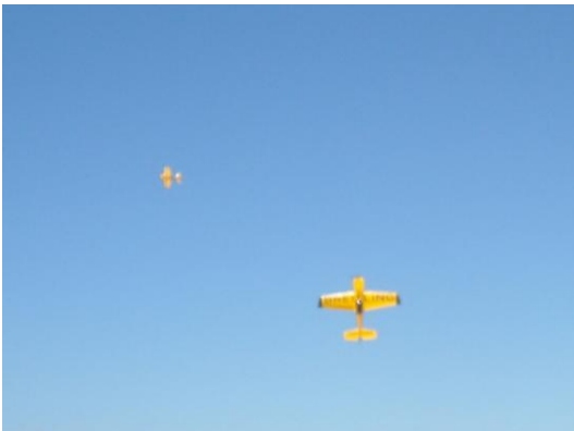
Starting their show