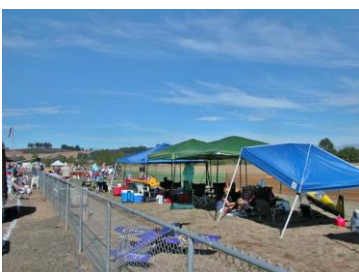
East side pit area