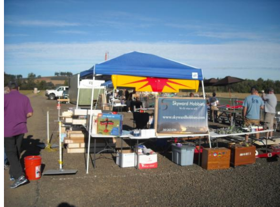
Stuff for sale