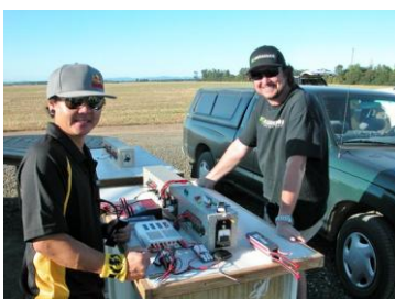
Battery charge time