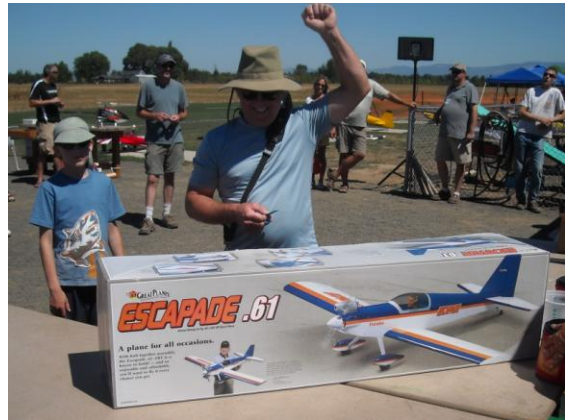
Another happy winner