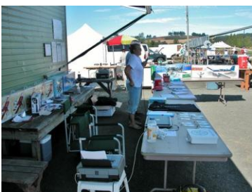
Ready for the pilots