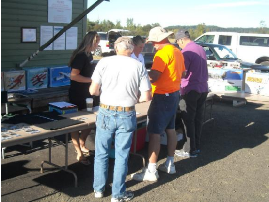
Pilot sign in