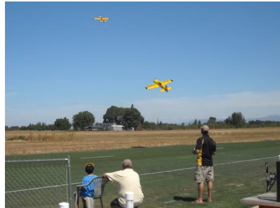
Both in the air